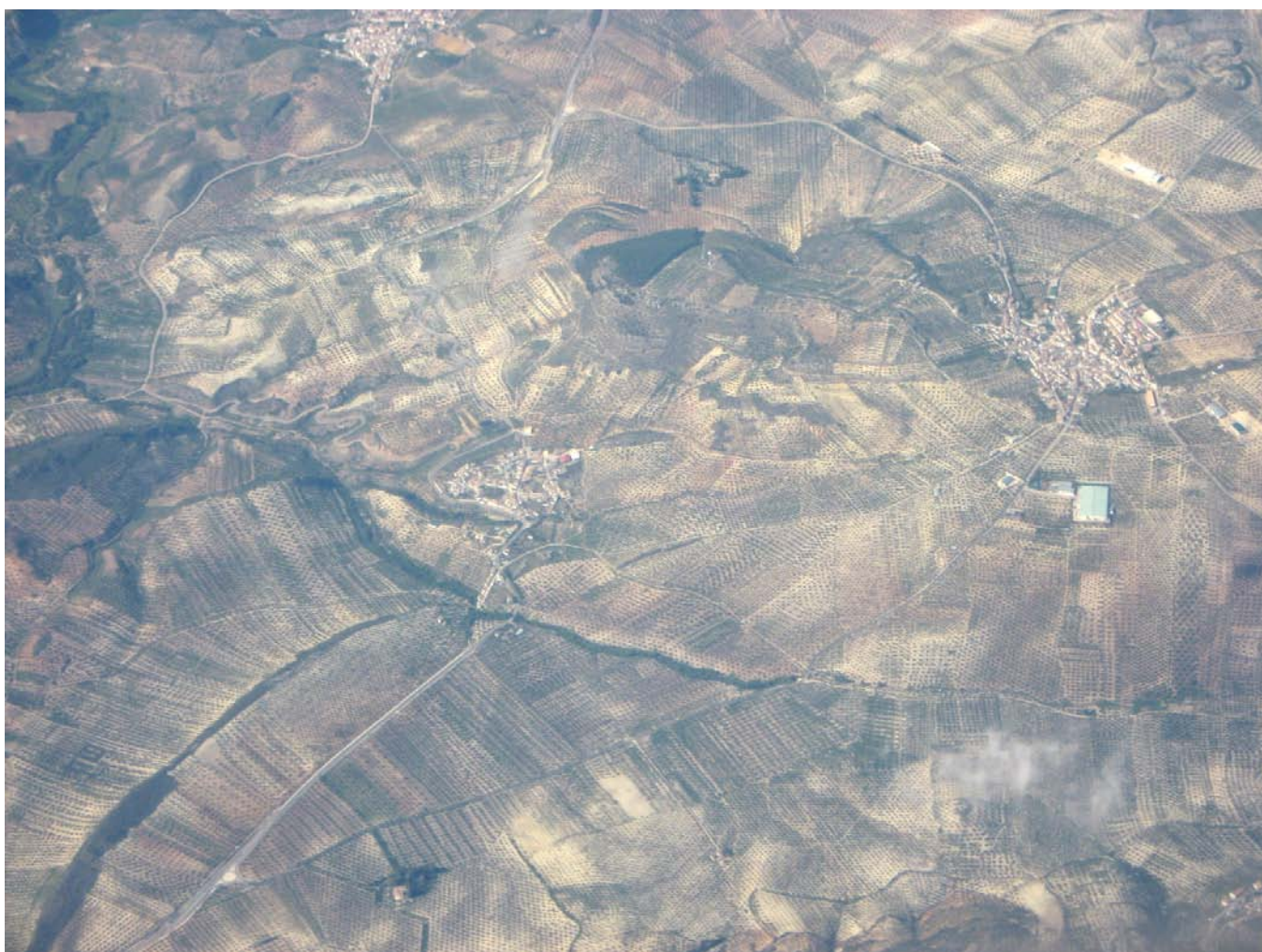
Picture 8: Irrigation expansion in southern Spain.

Already today, there is a trend of migration into cities, leaving the old generation back in the villages and countryside, with decreasing social services available to them. Traditions and the social network in the rural areas will seriously impacted by chronic droughts, directly by the economic impacts, but also indirectly by the younger generation fleeing to the cities and the job opportunities offered there. In the cities, this influx of rural migrants also stretches then further the social services, housing and the employment opportunities.