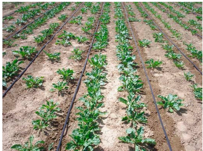
Picture 3: Contrary irrigation systems: Wasteful (left) and water efficient (right) irrigation systems.