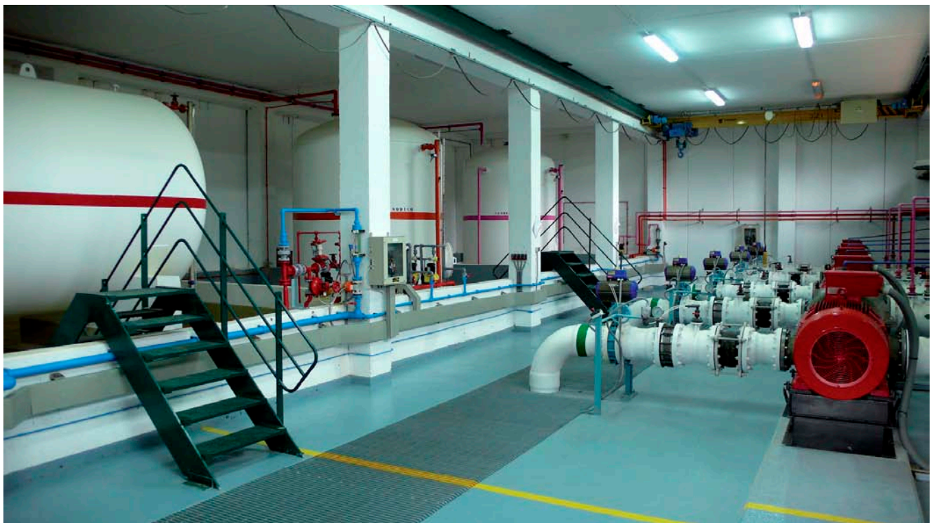
Picture 7: Inside desalination plant in Alicante, Spain.

Interest in the use of desalination technologies for drinking water production has increased in Turkey in recent years due to severe drought events experienced in last few years. Desalination technology is mostly used in Aegean coast by touristic facilities. While total capacity of desalination plants had been merely 3,600 m 3 /day in 2002, today it is nearly 31,000 m 3 /d. It is expected that before the end of 2008 total capacity will reach 120,000 m 3 /d and this is expected to triple in 5 years.