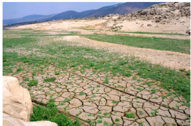
Picture 2: Drought in the Burguillo reservoir, in the Alberche River (Tagus watershed).

In February 2008 the Turkish Grand National Assembly (TGNA) agreed on the creation of a "Research Committee for the Effects of Global Warming and Sustainable Water Resources Management", inviting relevant institutions and organizations (including WWF-Turkey) to the Assembly and to work together on the preparation of an comprehensive report to be presented then in the National Assembly.