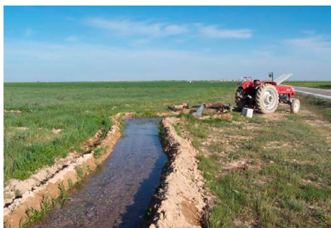
Picture 4: Illegal ground water extraction in Konya basin.

Total arable land in Turkey is 28 million ha and 8.5 million ha of this area is suitable for irrigation. Currently, Turkey's dams provide water for 4.89 million ha of arable land. It is estimated that by 2030 total irrigated arable land will increase and reach 6.5 million ha. 53