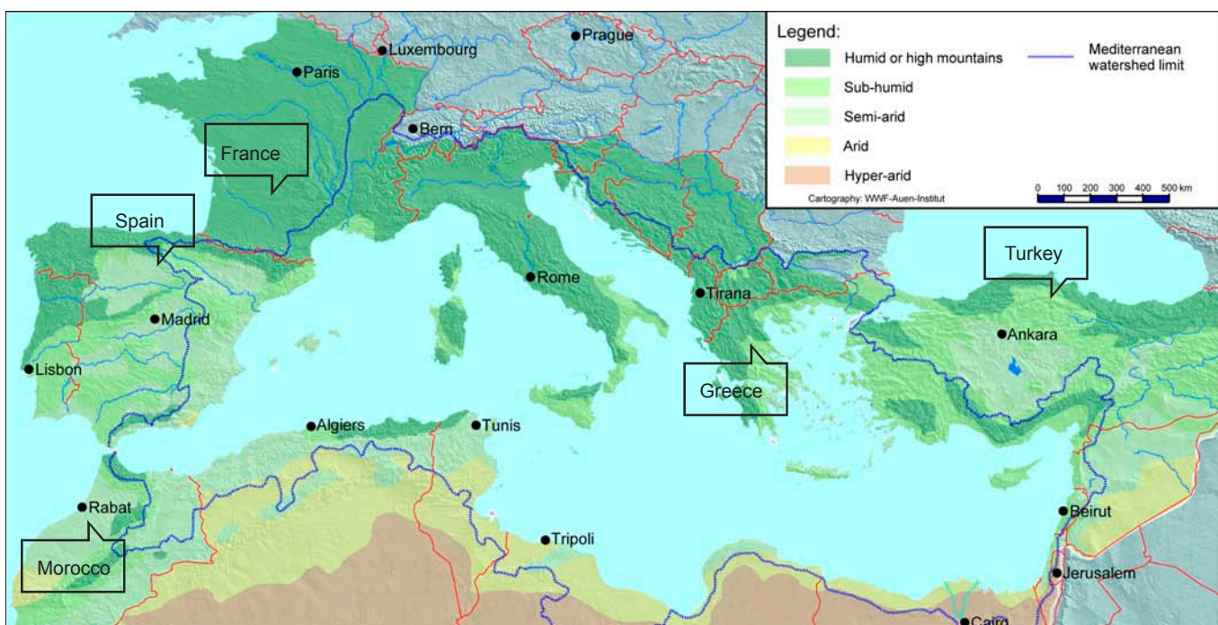
Figure 1: Mediterranean countries considered in the 2008 drought report

This WWF study exemplarily analyses the situation of 5 Mediterranean countries, namely France, Greece 1 , Morocco, Spain and Turkey (Figure 1), which are affected by water scarcity and droughts. The report takes both an agricultural and a climatic point of view. Even though this report does not want to provide an exhaustive assessment and does not pretend to be a complete survey for the Mediterranean basin, its aim is to showcase existing and in particular in the near future happening water challenges in the region, requiring immediate attention. If they are not properly addressed, droughts and thus water scarcity will develop into a chronic "disease" spread amongst many countries, with extremely high costs for the societies and economies concerned.