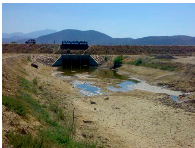
Picture 5: No flows left at the dam at the Great Menderes River.