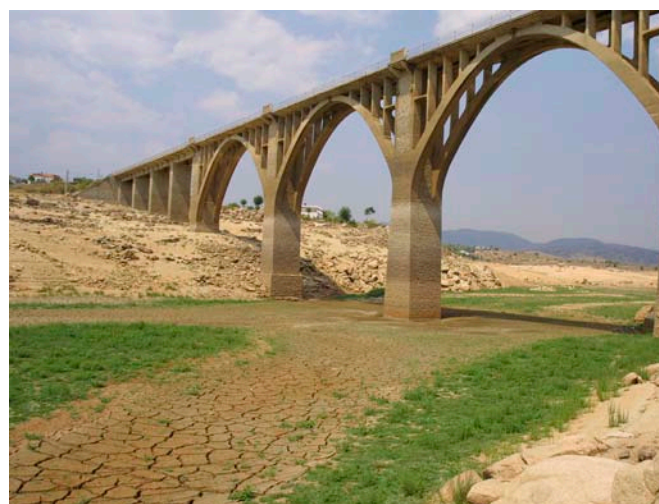
Picture 6: Parched Burguillo Reservoir in the Tajo catchment.