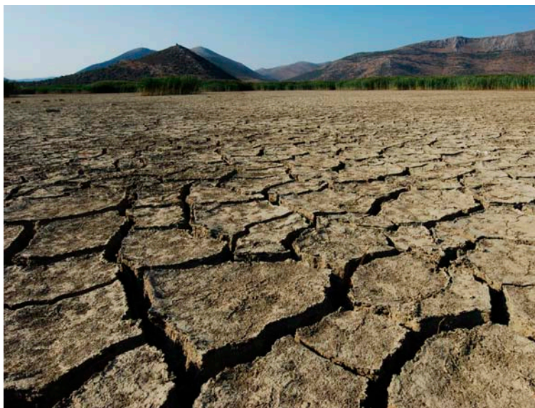
Picture 1: Parched Distos Lake at the Greek island Evia (Region of Stera Ellada)

According to the National Drinking Water Agency (ONEP) 9 drinking water for urban centres is drawn to 64,4% from surface water, 35.3% groundwater and 0.3% seawater desalination plants. Further to this, further quantities up to 50% have to be somehow compensated, which are lost due to obsolete and badly maintained pipe system for distribution and allocation (Tab. 2).