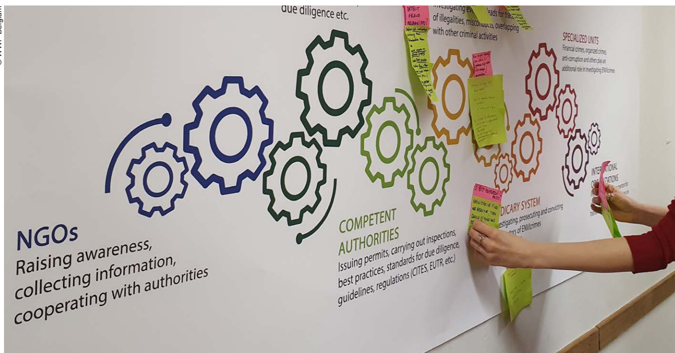
Workshop in Brussels, Belgium, February 2020