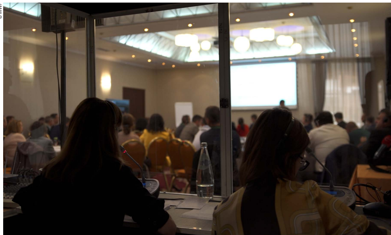
Workshop in Bucharest, Romania, October 2019

In Slovakia, a small number of powerful players influence the forestry business at different levels, from the decisions made by State enterprises to the type of timber being harvested (quality, quantity and species).