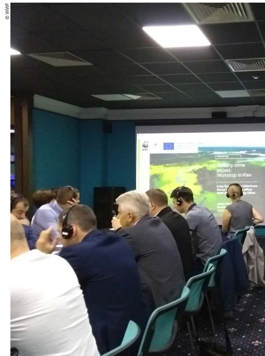
Workshop in Kiev, Ukraine, September 2019

Clear and comprehensive strategies on how to combat forestry crime are also lacking in all four countries, although there are some important steps forward, such as for example the implementation of the SUMAL (Integrated informational wood traceability system) in Romania.