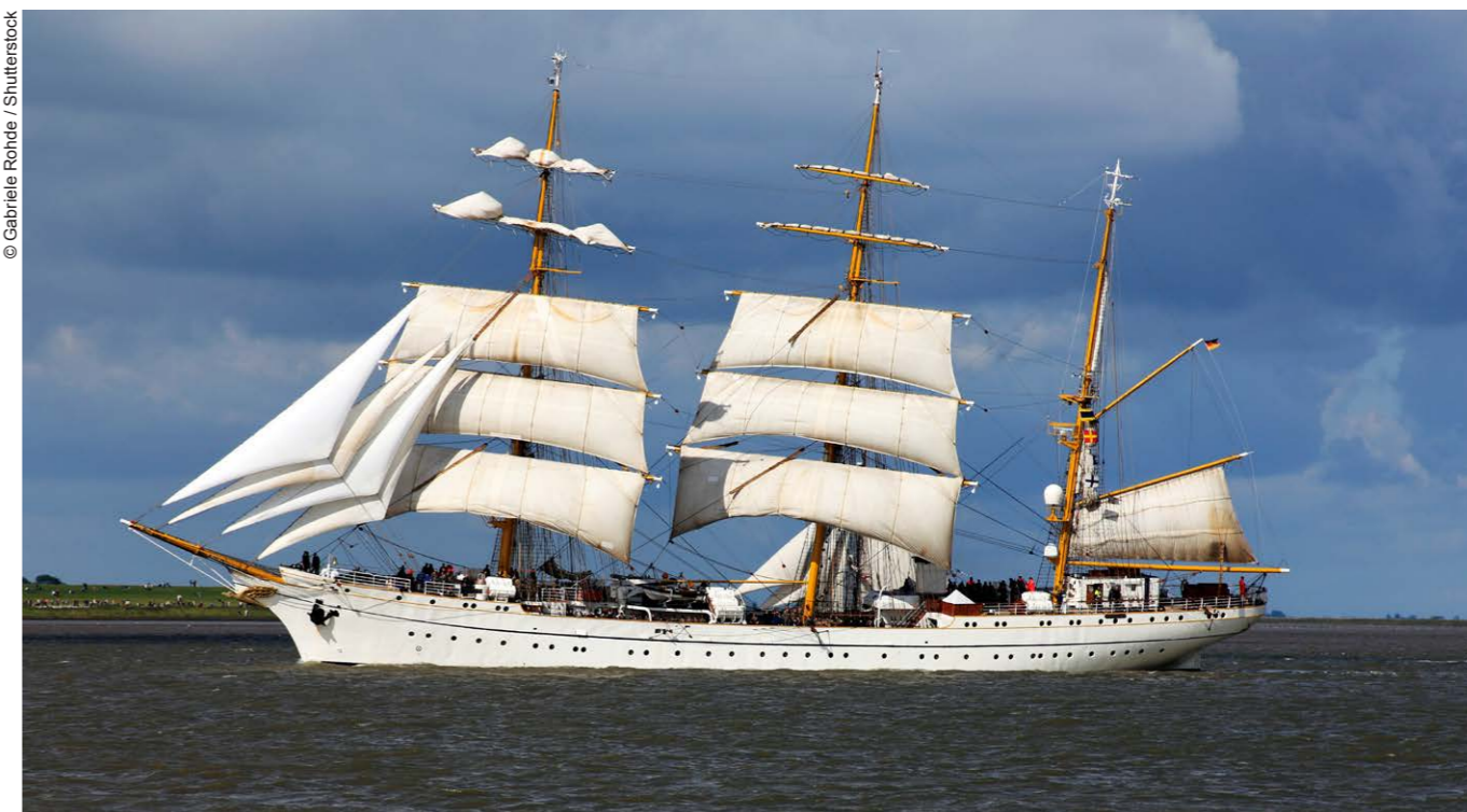
German navy sailing boat 'Gorch Fock'. The teak wood to restore its decking was ordered from Myanmar in violation of German public procurement guidelines and imported in violation of EUTR requirements 12 .

There are no dedicated task forces to bring together dedicated focal points from each administration in order to increase cooperation, exchange information and improve enforcement, although counterparts in other governmental bodies and authorities are/can be known.