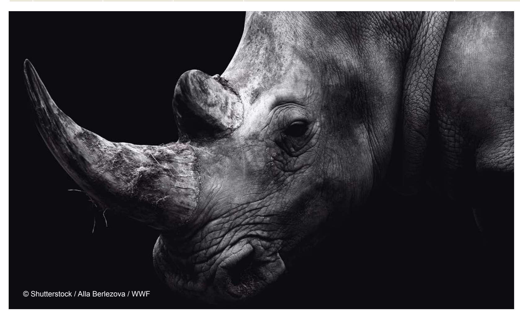
Southern white rhino (Ceratotherium simum simum)