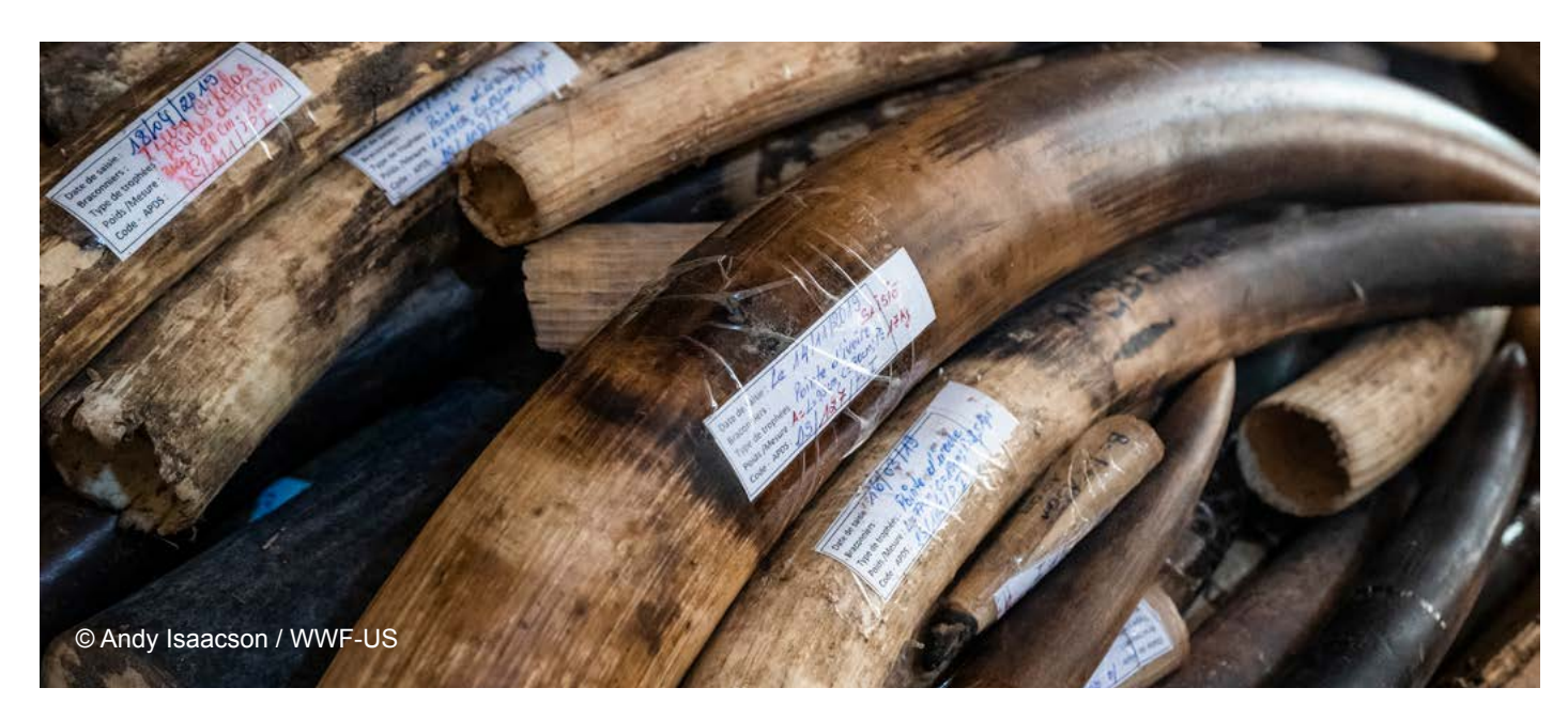
Confiscated ivory, at HQ of Dzanga-Sangha Special Reserve, Central African Republic