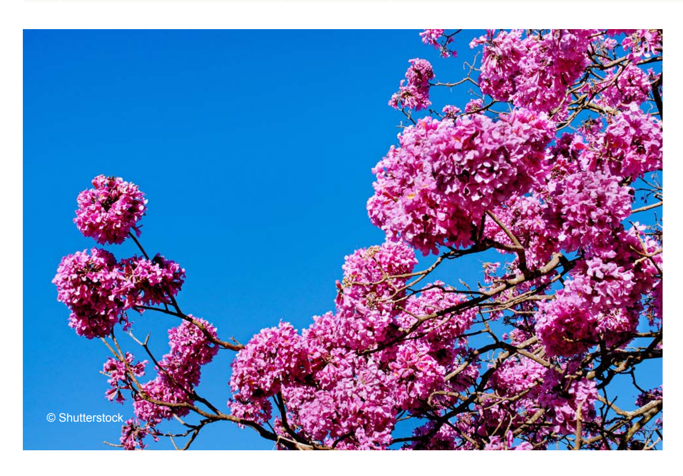
Pink Ipe, Handroanthus impetiginosus