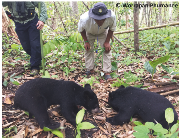
Image 1. Walking with two Asiatic Black Bear cubs during an assisted soft release in Thailand, 2016. The main purpose of walking with the bears is to prepare them for release to the wild. Walking with bears also affords the unique opportunity to observe bears in their natural habitat at close range, allowing researchers to obtain behavioral and ecological information that is not accessible otherwise. Here, caretakers observe foods the bears eat.