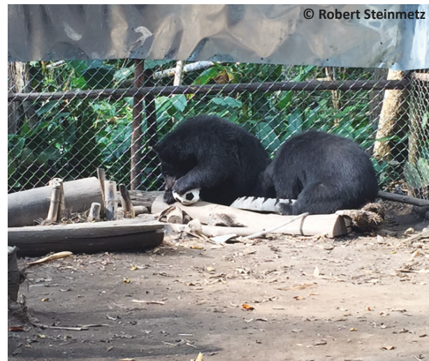
Image 2. Photo (January 2017) showing the healthy condition of two rehabilitated Asiatic Black Bears before final escape. The bears were about 14 months old in this photo. They were large for their age, with thick glossy pelage and full-bodied over all bony areas, indicating good body condition suitable for release.

cubs became reluctant to enter their enclosure after seven months of rehab (age 13–14 months) (Ashraf et al. 2008). And in Indonesia, Sun Bears refused to enter their enclosure after six months, choosing to live on their own in the forest but returning for food occasionally (Fredriksson 2001). In retrospect, we believe our bears were physically and behaviorally ready for release in month 8 of rehab (November 2016; they were about 45kg) but we kept them longer because natural food availability at that time of year was low (Steinmetz et al. 2013).