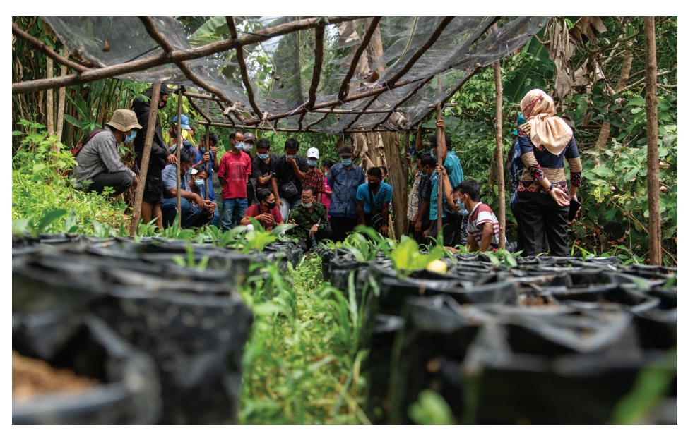
Farmers from Seberu village learn preparation and nursery techniques