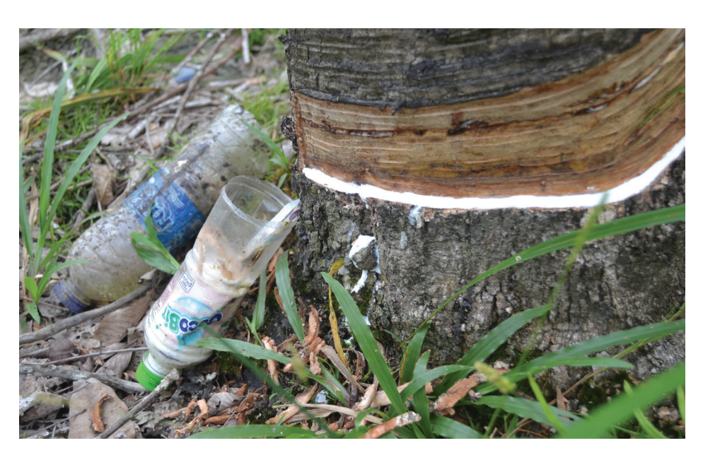
Collecting rubber with plastic trays

But why is the state of aggregation of the rubber so important? The standard processes recommend that the rubber should undergo a simple drying process to meet the factory standards, whereas smallholders are used to sell wet