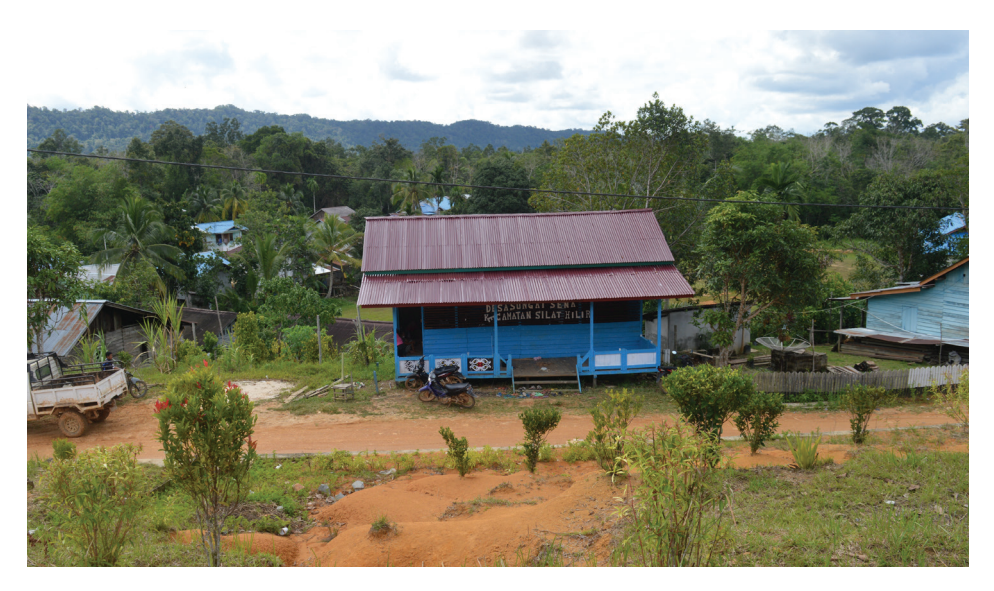
Training Centre and gallery in Sungai Canggai