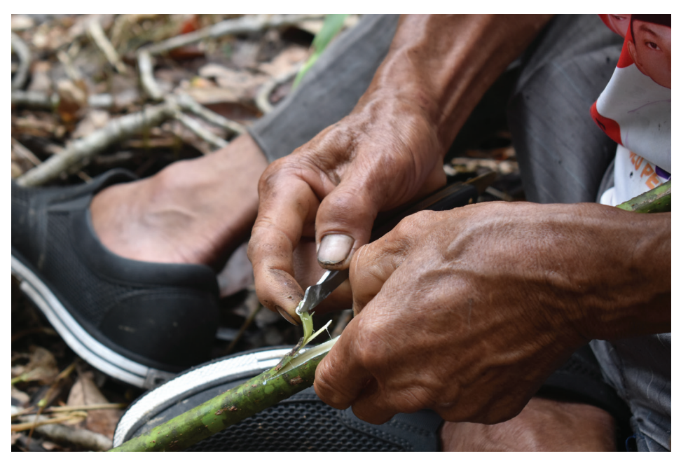
A community member prepares the rattan

Between February and April 2019, the Tuah Menua handicraft group received a training to implement standards for their handicraft products. Until today, eleven types of woven products, especially household furniture and accessories like mats ( perupuk ) or bags ( takin ), have been designed.