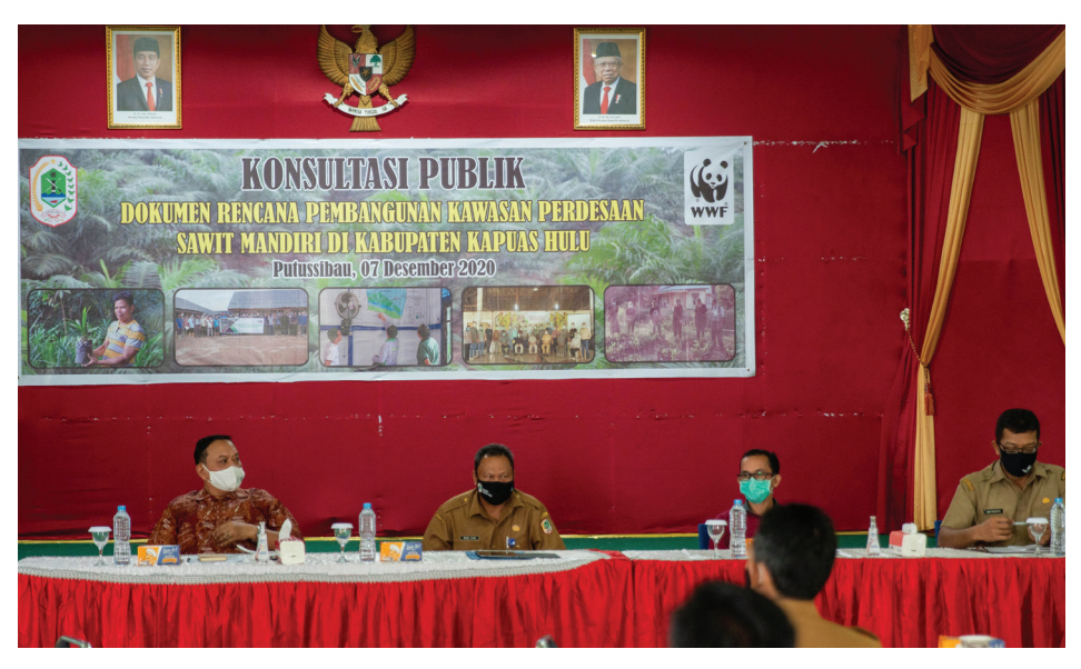
Public consultation of the Rural Area Development Plan in Putussibau

After the development plan was finalized, WWF organized a public event on the 7th of December 2020 to hand over the plan to get approval from the Bupati. Since then, the district government has taken further steps to implement the development plan such as provision and distribution of subsidized fertilizer, issuance of plantation business permits etc.