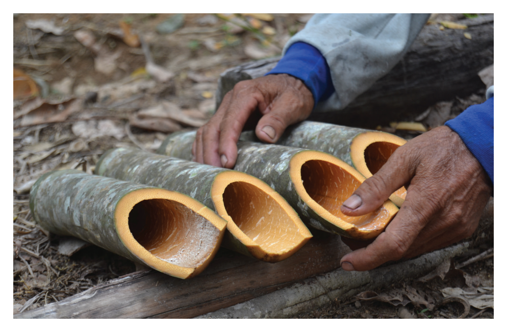
A farmer is preparing the bamboo to collect rubber

prices. In the trainings the farmers learnt how to dry the tapped product. At the same time, it is important to connect the smallholder groups with buyers at factory level. "In the future, we plan to bring the smallholder groups together with the rubber processing factories to secure a mutual agreement regarding the quality and quantity of dry rubber. If smallholders possess a bargaining power and a price agreement can be reached, the road to prosperity will open up," explains Krispinus, the Director of Diantama.