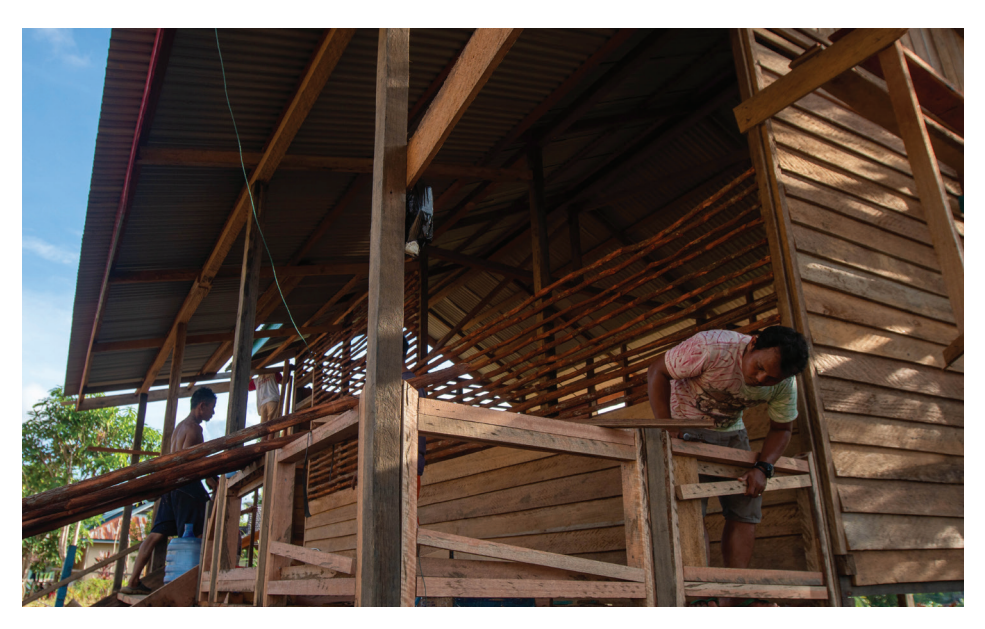
Construction of the Training Centre and gallery in Sungai Canggai

But implementing the activities in Sungai Canggai can be challenging. Especially during the rainy season, it is very difficult to access sub-villages like Sungai Canggai as roads are damaged due to excessive rainfall and motorcycles are covered with mud. But once you enter Sunggai Canggai on the road, you cannot miss a wooden building. The six by eight meters building consists of a terrace, a spacious room, and a small storage room and is called the Sungai Canggai Tuah Menua Gallery Training Centre . The centre provides space to display the products of the handicraft group.