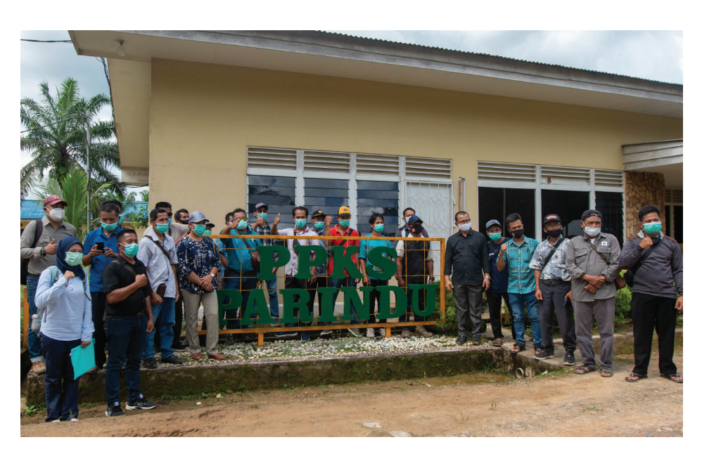
Participants of the study tour to the Parindu Palm Oil Research Center

delivery. AMB members have now started to purchase certified superior seeds. In addition, the project conducted five training series. They were attended by 198 farmers and 176 interested community members who gained knowledge about planting, maintenance, pruning, fertilization, and integrated pest control, to promote sustainable farming techniques.