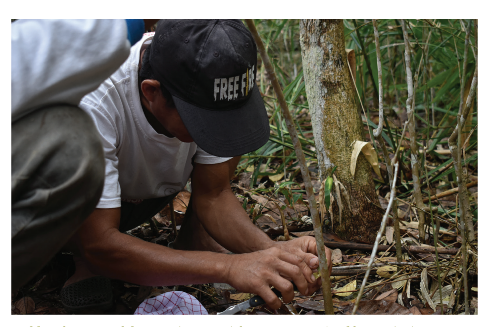
Rubber farmers of the Gerai Nyamai farmer group © Alfeus Krispinus