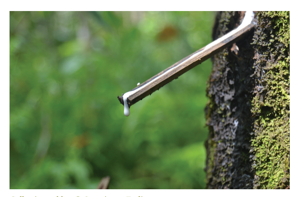
Collecting rubber

Jointly with the communities Seberu and Pala Kota, the project also established two rubber farmer groups, the Tembawang Mangkuk rubber farmer group in Seberu and the Gerai Nyamai rubber farmer group in Pala Kota. Tembawang Mangkuk implies the meaning of "life obtained from cultivated land". Gerai Nyamai signifies "a healthy, happy and prosperous life". From September until December 2019, the two rubber farmer groups received support on capacity building for rubber plantation land mapping, organizational development trainings, the development of standard operating procedure manuals, and the management of their plantations.