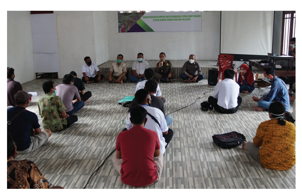
Formation of the farmer group Tani Sagu and Jintan Mandiri in Seberu

Besides the farmer group in Pala Kota, two groups have been established in Seberu and three in Sungai Sena.