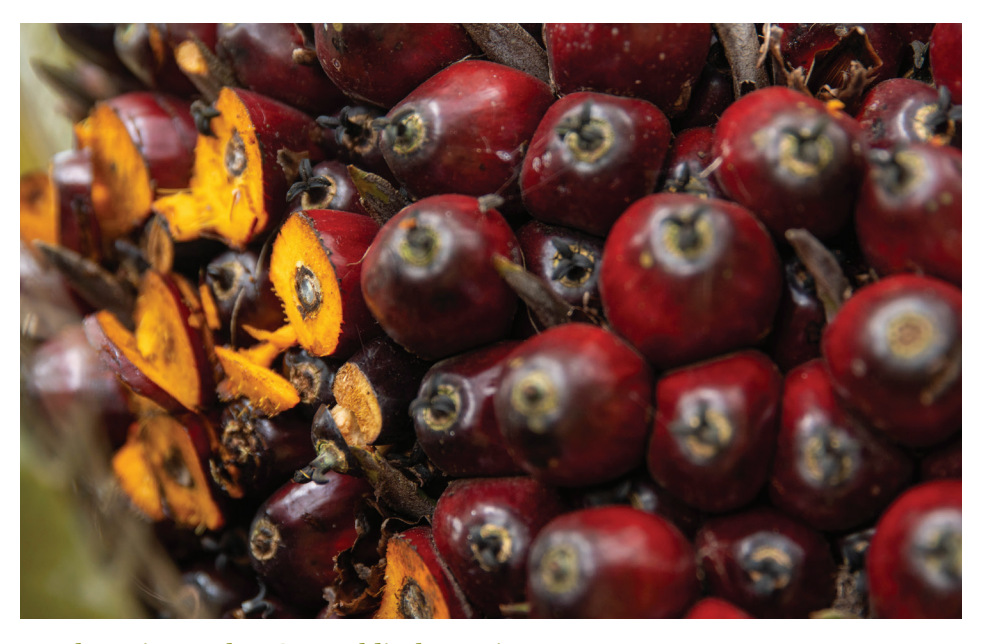
Fresh Fruit Bunches

The team also visited another factory owned by PT Permata Subur Lestari. Their crude palm oil serves the national demand and is processed in Jakarta. Three aspects are important for the company, according to the mill coordinator