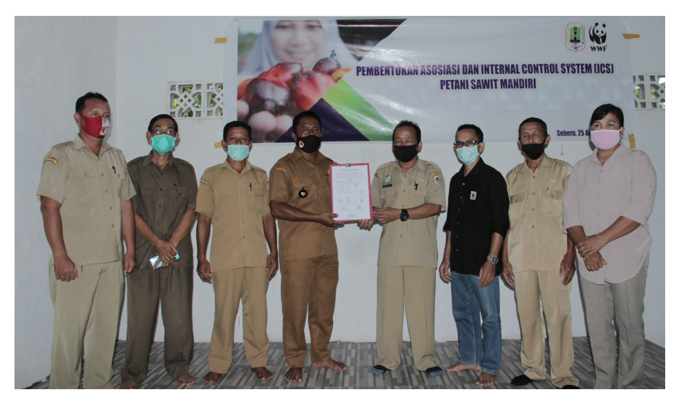
The approval of the formation of the farmer association AMB is handed over

With the establishment of the six farmer groups and the association, the farmers have more self-confidence, a better bargaining position, more personal and organizational capacities, and a long-term perspective. The increased capacity to look for alternative solutions provides a way for them to build new relationships with external parties, especially the palm oil mills and local governments.