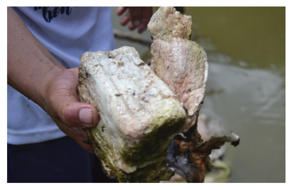
A farmer shows the dried rubber

prices. In the trainings the farmers learnt how to dry the tapped product. At the same time, it is important to connect the smallholder groups with buyers at factory level. "In the future, we plan to bring the smallholder groups together with the rubber processing factories to secure a mutual agreement regarding the quality and quantity of dry rubber. If smallholders possess a bargaining power and a price agreement can be reached, the road to prosperity will open up," explains Krispinus, the Director of Diantama.