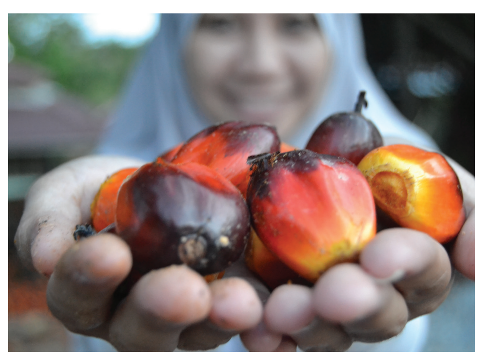
Palm oil fruits

To achieve these objectives, the project tries to ensure the long-term support on promoting sustainable palm oil from the local government. The WWF team has conducted several meetings and workshops to advocate for policy support and commitment from representatives of government entities and the administration. This work was aligned with the ongoing political developments in the district. Already in 2014, the local government of Kapuas Hulu established a Strategic Agropolitan Area, covering seven sub-districts. The aim of this strategic area is to promote the economic development of the area. Since 2020, it is implemented by the Rural Area Development Program (PKP) that includes pilot projects in five villages.