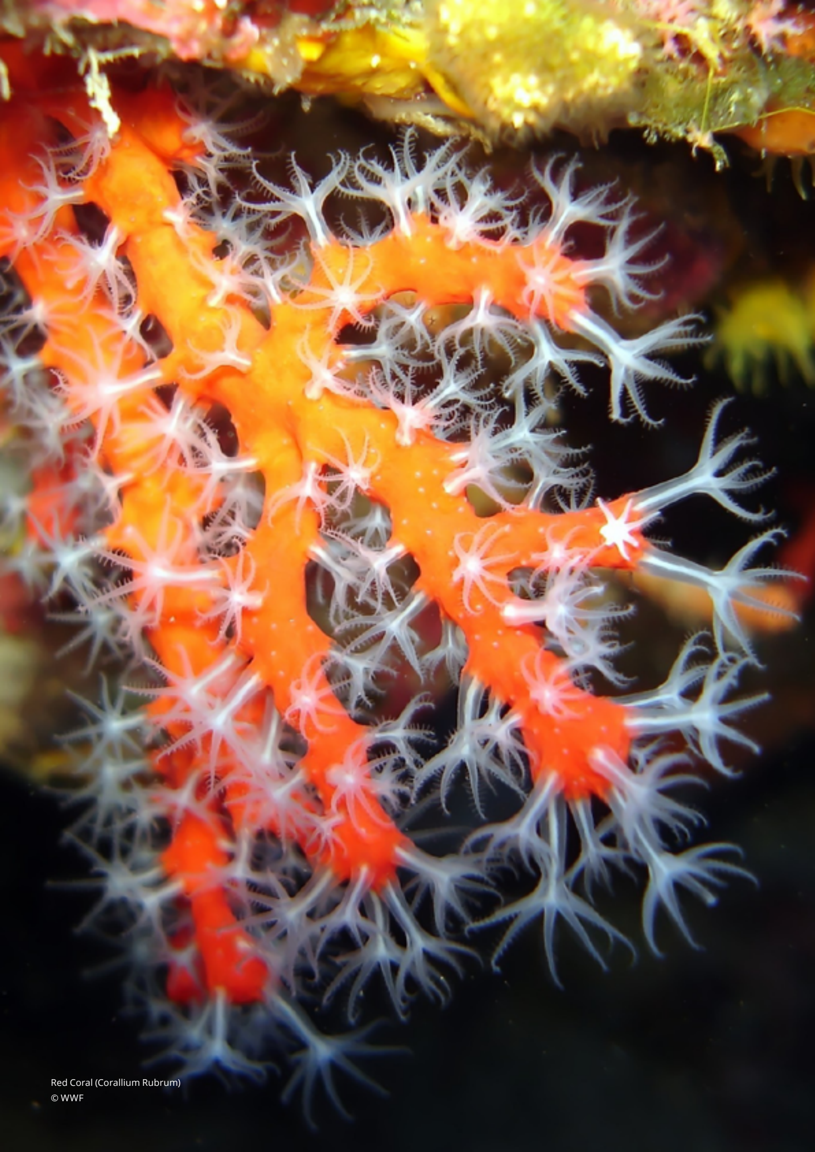
Red Coral ( Corallium Rubrum )