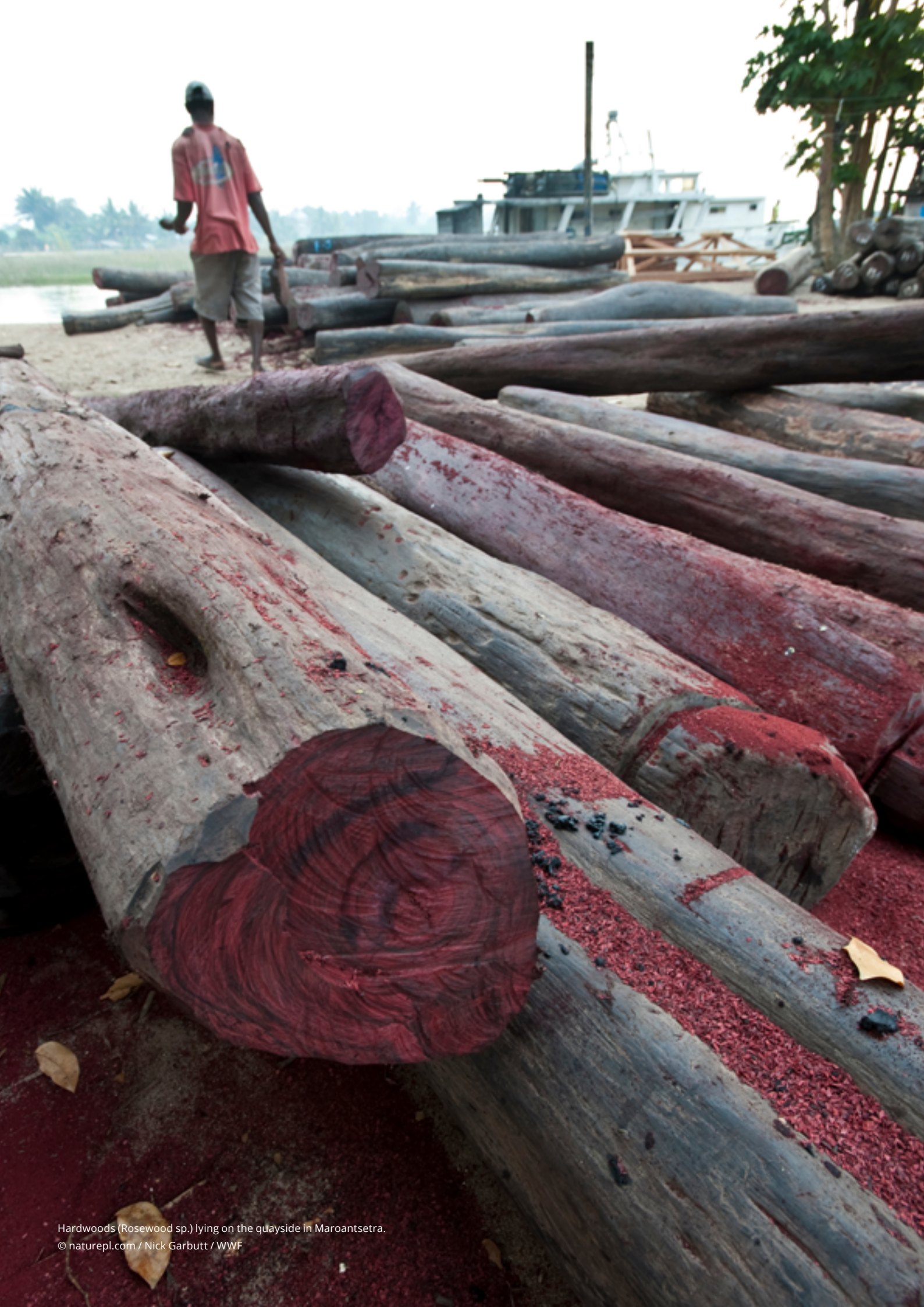
Hardwoods (Rosewood sp.) lying on the quayside in Maroantsetra.