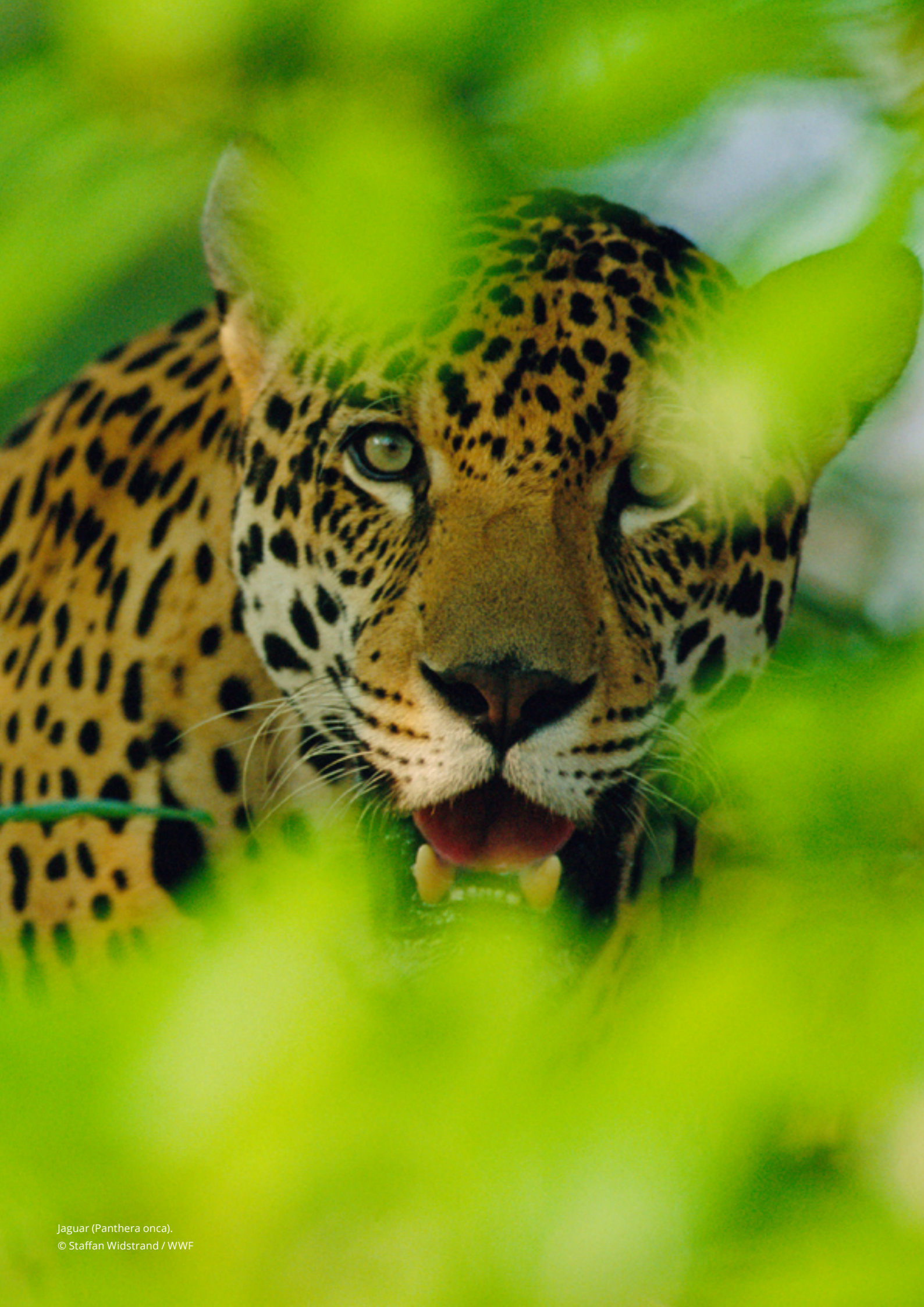
Jaguar ( Panthera onca ).