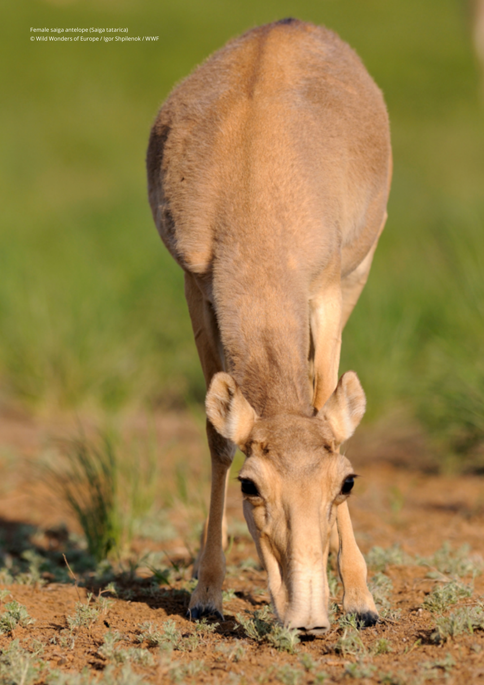
Female saiga antelope ( Saiga tatarica )