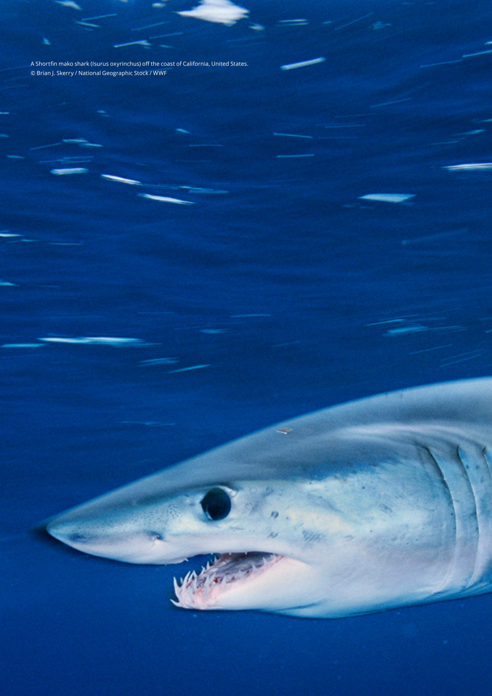
A Shortfin mako shark ( Isurus oxyrinchus ) off the coast of California, United States.