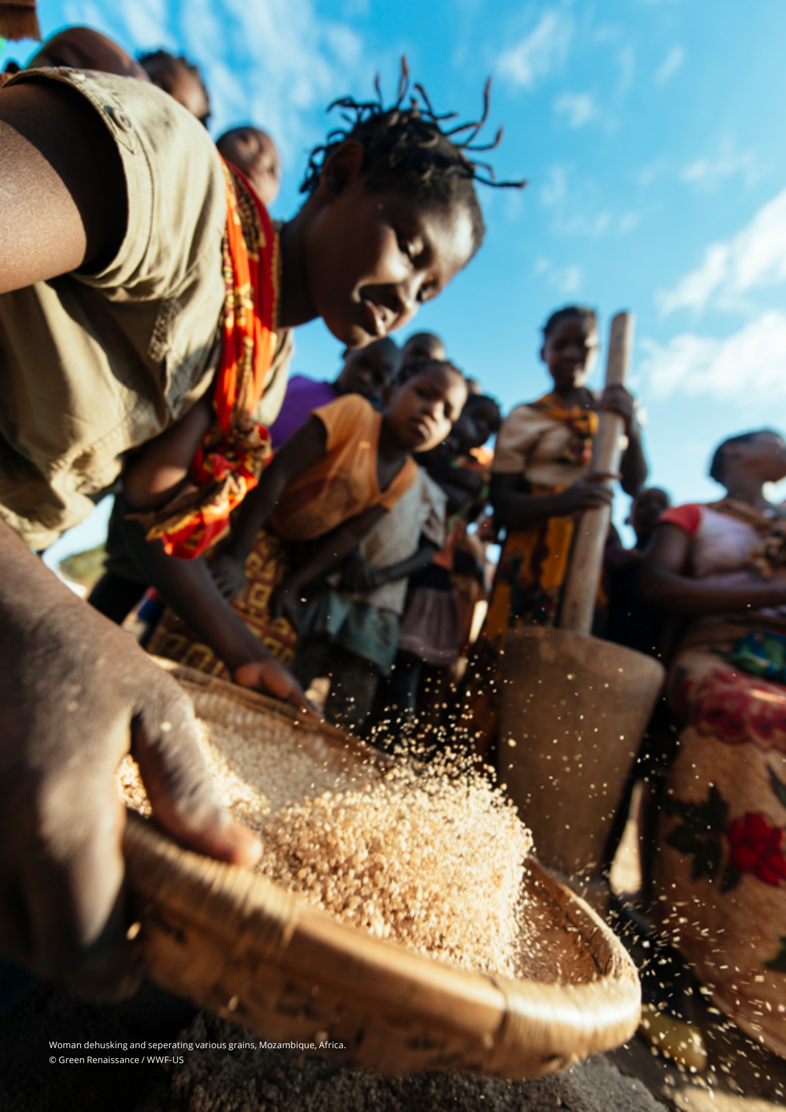
Woman dehusking and separating various grains, Mozambique, Africa.